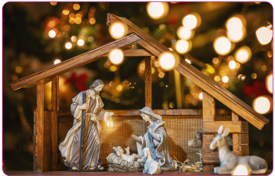
Figure 2.4 A nativity scene

The Christmas season concludes with Epiphany . This is celebrated annually on January 6. On Epiphany, believers remember the 'wise men from the east' who followed a star in search of 'the newborn King of the Jews', and brought gifts for the newborn Jesus.