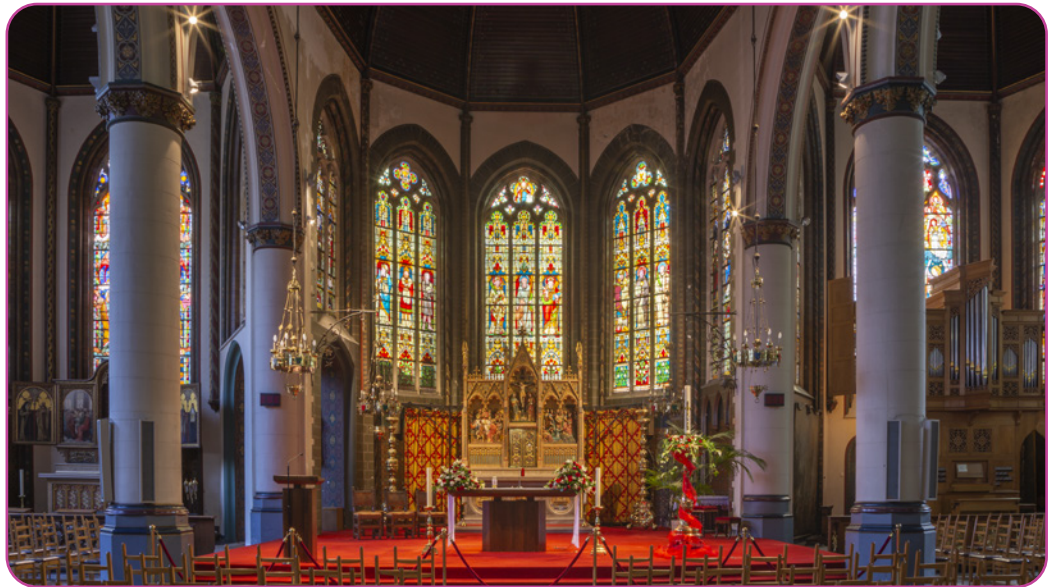
Figure 2.1 Church buildings are places of worship for Catholics. The photo shows the Saint Giles church in Bruges, Belgium.