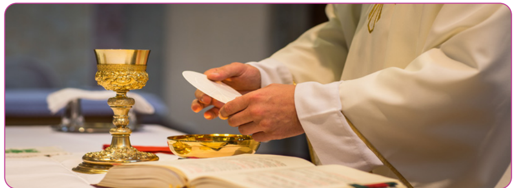
Figure 2.2 The moment of the Eucharist during Mass.

The Eucharist reminds Christians of the Last Supper. This is the last meal Jesus shared with his disciples, who are also called the apostles. During the Last Supper, Jesus broke bread and shared it. Then Jesus said, "This is my body, which is given for you" (Luke 22:19). Jesus also circulated wine, which he called his blood: "This cup that is poured out for you is the new covenant in my blood" (Luke 22:20). With these words, the sacrament of the Eucharist emerged. Jesus asked his disciples to keep repeating the meal this way. That is why the ecclesial community has come together from the very beginning to celebrate the Eucharist. The celebration of the Eucharistic is not only a commemoration of the Last Supper, but also the commemoration of Christ and the Easter mystery.