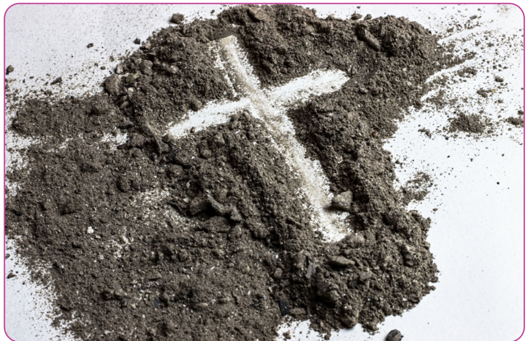
Figure 2.5 On Ash Wednesday, believers receive an ash cross.

The last week before Easter is called Holy Week by Christians. Holy Week begins with Palm Sunday, when believers commemorate the story of Jesus' entry into Jerusalem. The day before Jesus' death on the cross, Christians celebrate Maundy Thursday, which is when Jesus shared the Last Supper with his disciples. On Good Friday, Christians then commemorate the suffering and death of Jesus. Jesus died for the sins of all people. Silent Saturday is the day before Easter, when Christians reflect on the death of Jesus. And on Sunday, Christians celebrate Easter.