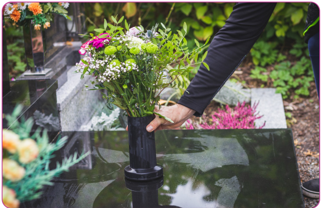
Figure 2.7 On All Saints Day and All Souls Day, Christians visit the cemetery in memory of all the deceased.

On the last Sunday of the liturgical year, believers celebrate the feast of Christ the King . This feast signifies the end of the liturgical year. Advent, the beginning of a new liturgical year, starts a week later.