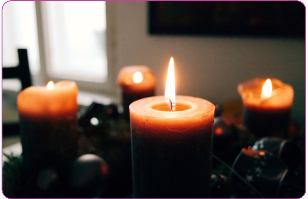
Figure 2.3 An Advent Wreath

The first Sunday of Advent marks the beginning of the liturgical year within the Catholic Church. Advent is the period leading up to Christmas . It is the preparation for Christmas, during which Christians look forward to the coming of Jesus. During Advent, the four weeks leading up to Christmas, Christians decorate a wreath. This Advent wreath is decorated with four candles. Each Sunday of Advent, a new candle is lit to count down to the birth of Jesus Christ.