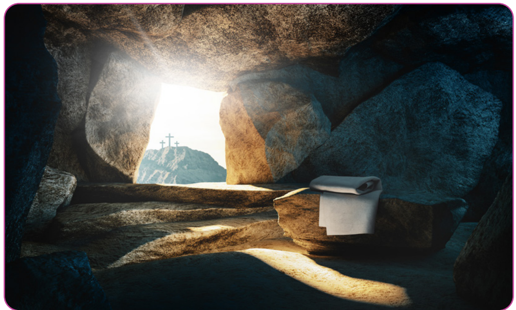
Figure 2.6 At Easter, Christians celebrate the resurrection of Jesus.

Forty days after Easter, Christians celebrate Ascension Day. With Ascension , believers commemorate Jesus being taken up into heaven, with God the Father, after his resurrection. Just as Ascension is connected to Easter in this way, the feast of Pentecost is also connected to the Easter story. Pentecost falls ten days later than Ascension, or fifty days after Easter. On this day, Christians commemorate the coming down of the Holy Spirit. On Pentecost, Christians commemorate that Jesus did not abandon them after Ascension; on the contrary, Jesus announced the coming of the Spirit himself. This also brings us to the concept of the Holy Trinity, Christians in particular always speak of God in triplicate: God the Father, Jesus Christ the Son and the Holy Spirit.