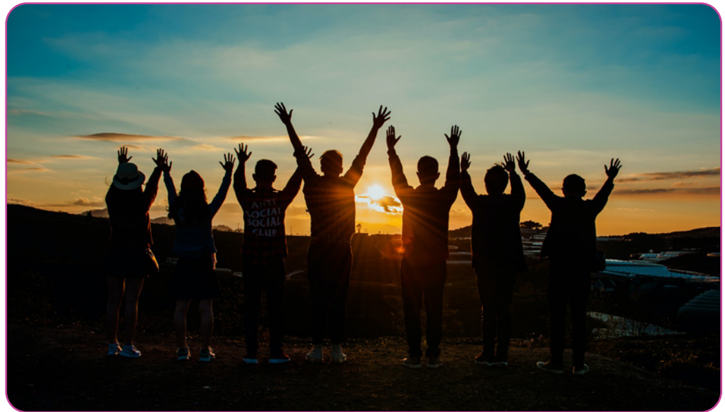
Figure 6.8

Such integrative approaches can attain the indispensable balance between individual and societal aspects of ethics education. "As Socrates would have it, the philosophical examination of life is a collaborative inquiry. The social nature of the enterprise goes with its spirit of inquiry to form his bifocal vision of the examined life. These days, insofar as our society teaches us to think about values, it tends to inculcate a private rather than a public conception of them. This makes reflection a personal and inward journey rather than a social and collaborative one and a person's values a matter of parental guidance in childhood and individual decision in maturity" (Cam, 2014, 1203; cf. Strahovnik 2018).