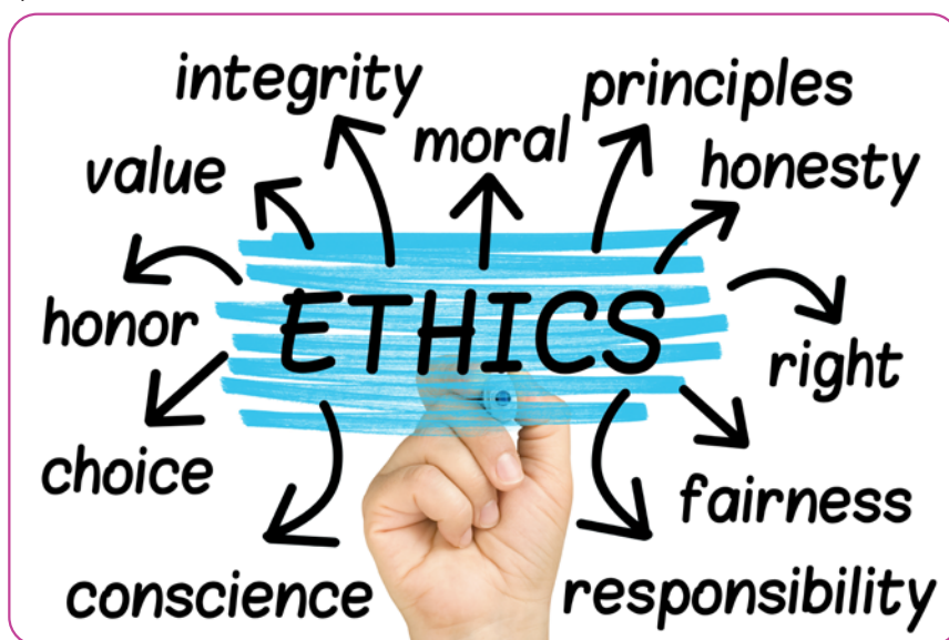
Figure 6.10 Ethics Word Cloud

Ethics: a reflective system of values, principles, virtues, and ideals that shape our lives and determine the basis for the relationships that we form with others as well as ourselves. It is the primary subject of moral philosophy as an academic discipline.