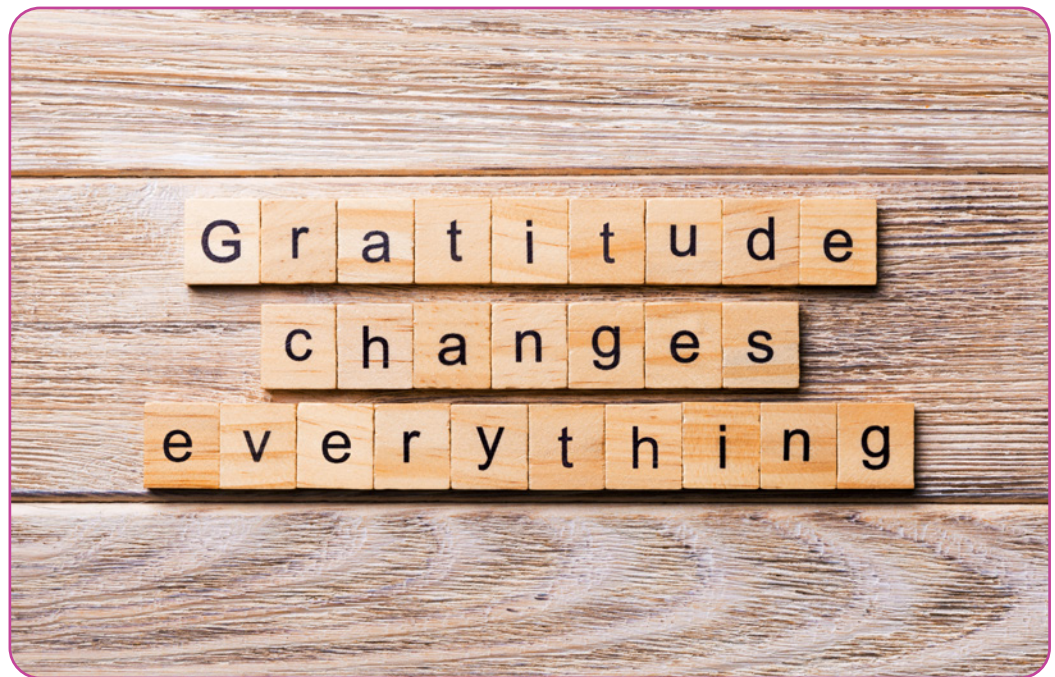
Figure 6.5 Gratitude

Virtues are human morally important qualities, dispositions for action or personality traits. They are closely related to human character and can be understood as excellencies. The opposite of virtues are vices, flaws or shortcomings. For example, moral virtues are honesty, kindness, compassion, courtesy, generosity and so on. Virtues include several components, namely cognitive, emotional, motivational, and action-oriented. Morally correct are those actions that are the result of or originate from our virtuous character. The founding fathers of virtue ethics are Plato and Aristotle.