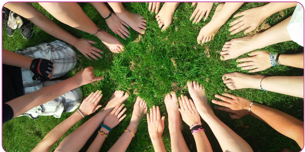
Figure 6.7

There are also proposals that ethical theory itself is the foundation for ethics education must be centered around it. Warnick and Silverman note that “[a]nother way of looking at ethics education, a favourite among traditional philosophers, is to see professional ethics education as an opportunity to learn about philosophical theories of ethics. Under this approach, the students are taught one or more ethical theories (usually utilitarianism, Kantian deontology, or care theory) and are then taught to apply these theories to resolve, or at least inform, ethical dilemmas” (2011, 274).