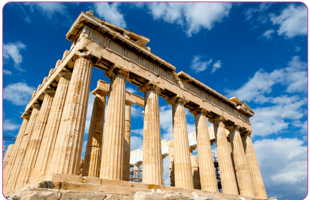
Figure 6.2 Parthenon

The term “ethics” comes from the Greek word “ēthikós”, which is a variant of “êthos” and primarily refers to our moral character, that is to the persons that we are or aspire to be. Another term for ethics is morality as in when we say that somebody did something that was morally right or morally good. Ethics is the foundation of our relationship to ourselves and the world around us. The purpose and role of ethics have always been the preservation of the human being as a person, human dignity, and the conditions for leading a good life. Today, the current culture in which we live is characterized mainly by pluralism. We have to deal, with crises and turmoil that we are experiencing, with the increasing interconnectivity of the world (globalization) and our dependency on one another. Our cultures are often characterized by the “relativization” of values, which is fundamentally an expression of diminished confidence in society and the loss of confidence about the answers to our existence’s fundamental questions. Ethics protects and sustains the humanity of our existence, both in ourselves and in others. We always live in relationship with others, namely in a relationship of mutual giving and receiving. Therefore, acknowledging our dependence on others and caring for others is essential (Ethics education resources, 2021).