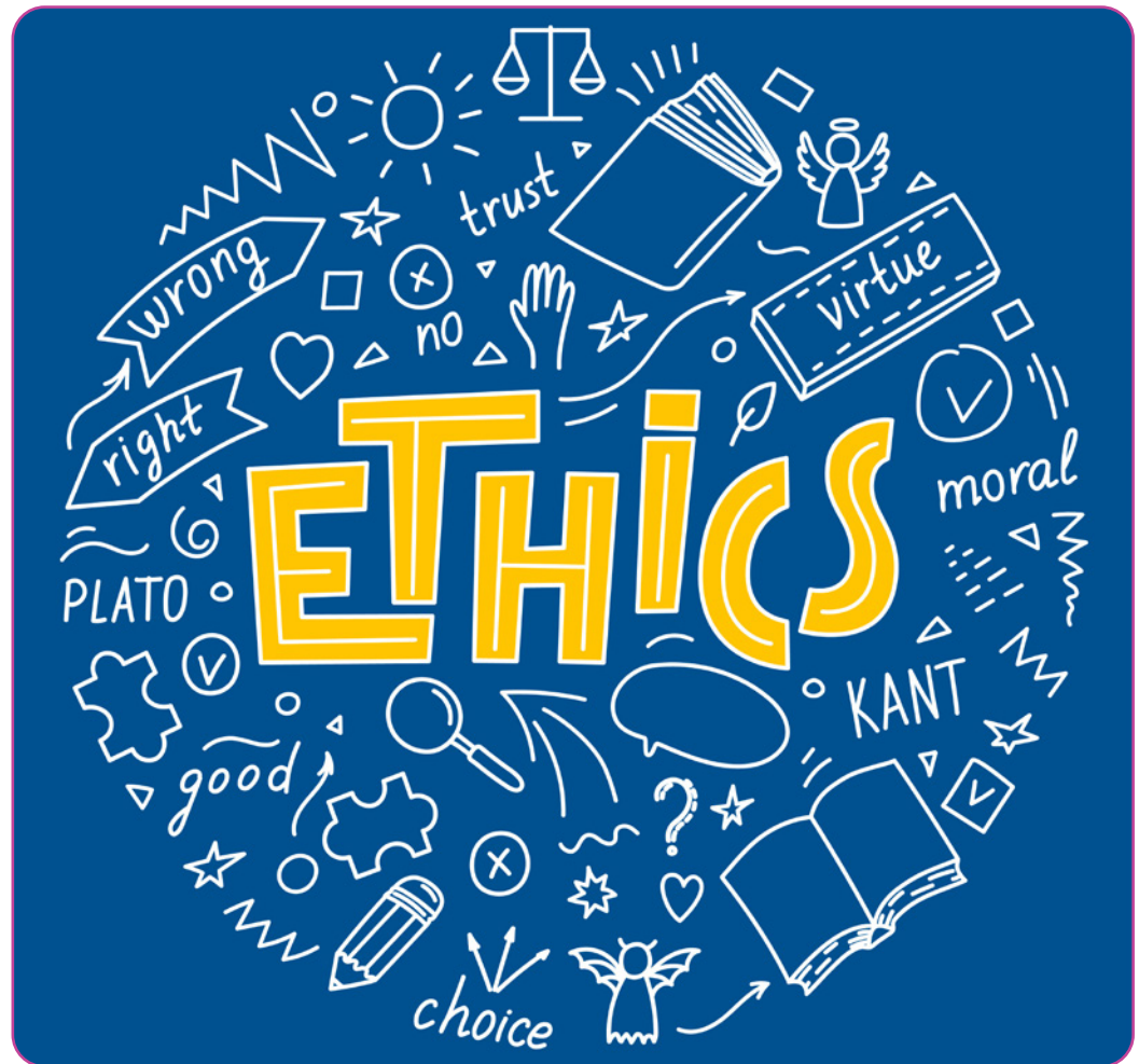
Figure 6.3 Dimensions of Ethics

Moral principles and rules can be understood in several ways. The most fundamental is the understanding of moral principles as moral criteria or standards. The principles and rules thus understood set out the ethical criteria for our conduct and the judgment of that conduct; they define what is right and what is wrong. Closer to everyday morality is another way of understanding moral principles and rules, i.e., as guides in our decision-making and action. Their value lies in their usefulness as reliability of guidance regarding what to do.