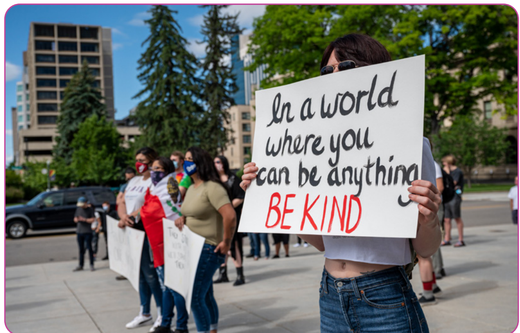
Figure 6.6 Manifestation