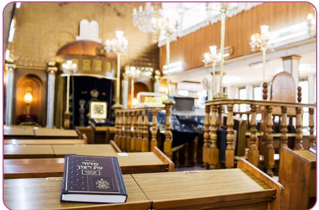
Figure 1.1 The interior of the synagogue Brahat ha- levana in Bnei Brak, Israel.

Our synagogue plays a very important part in my Jewish community. Me and my family go each time, which is three times a week . In the middle of the synagogue is a bimah . It's difficult to describe... It's kind of like a heightened platform! On it are a couple of important people for our services. One of them is the chazan . He sings and recites a lot of the prayers. He leads the synagogue service! There is also the baal koree , who reads from the Torah-scroll. This is so difficult, there is even a special education designed to learn to this. The Torah has to be carried to the bimah from a safe storage room. We call this storage room the Torah Ark , or Holy Ark . There is a parochet hanging in front of it, which is a beautifully ornamented piece of fabric. This synagogue-service is a special occasion, because I get to be part of the minyan . This is a special chorus made up of ten adult men . I had my bar mitzvah last week, so I'm finally old enough to be a part of it! Some prayers can only be recited by us. My sister would like to be a part of it, too, but in our synagogue, that is not allowed. It is a halachic rule!