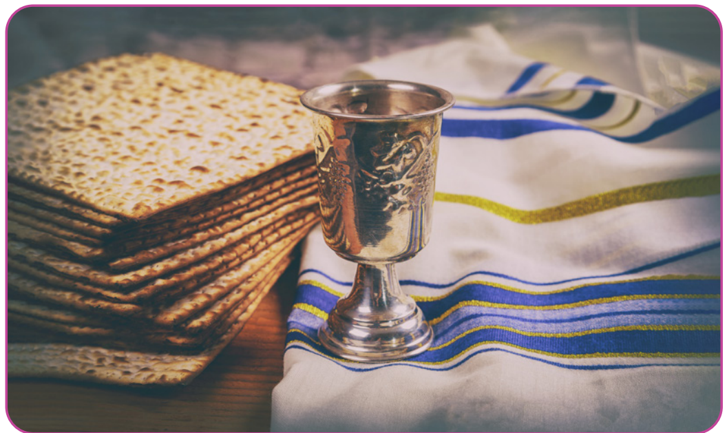
Figure 1.2 Passover wine and matzoh jewish holiday bread wooden board.