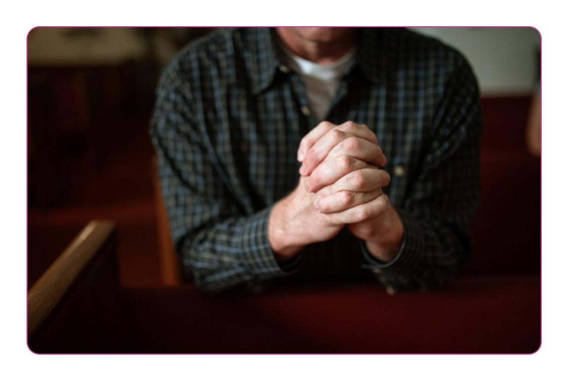
Figure 2.6 A person who is praying.

3. If you do not pray, do you understand why others do? What would you like to ask them?