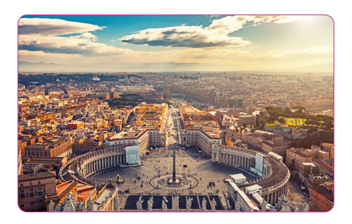
Figure 2.5 The photo shows St. Peter's Square in the Vatican City.

3. Vatican City is a special place for Catholics. It is the only place where the Bible, the sacred text of Christianity, can be read. RIGHT / WRONG