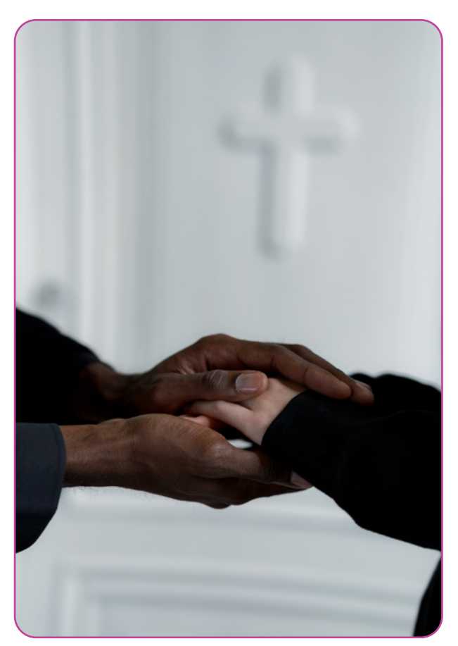
Figure 2.2 Catholic believers find closeness with each other, the Church community, and God.

2. What information about the Catholic faith is new to you?