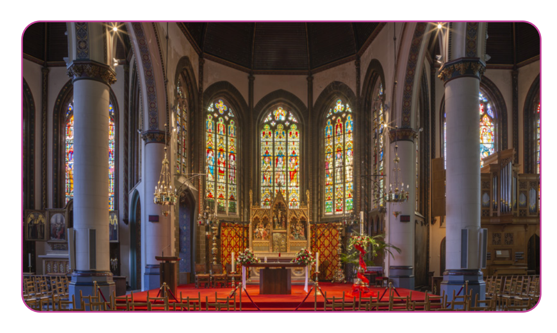
Figure 2.1 Church buildings are places of worship for Catholics. The photo shows the Saint Giles church in Bruges, Belgium.