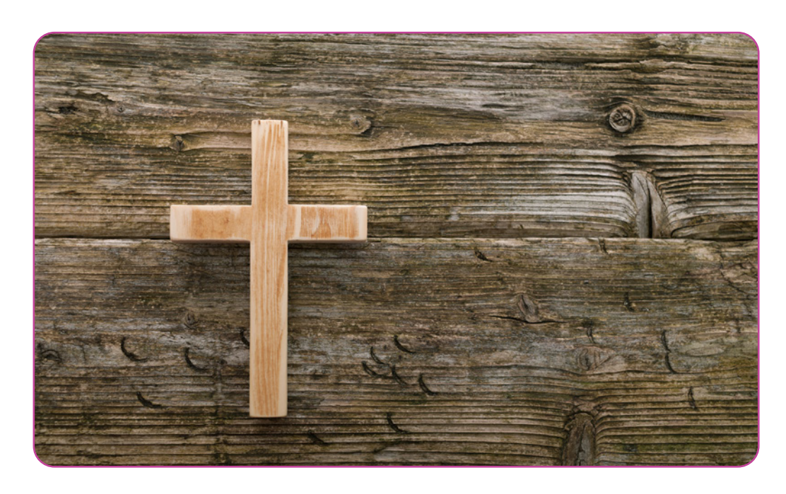
Figure 2.4 A cross is one of the most important symbols for Catholics.

1. Jesus lived in the first century of the Christian era. He was a unique and inspiring person. He encountered no opposition throughout his life. RIGHT / WRONG