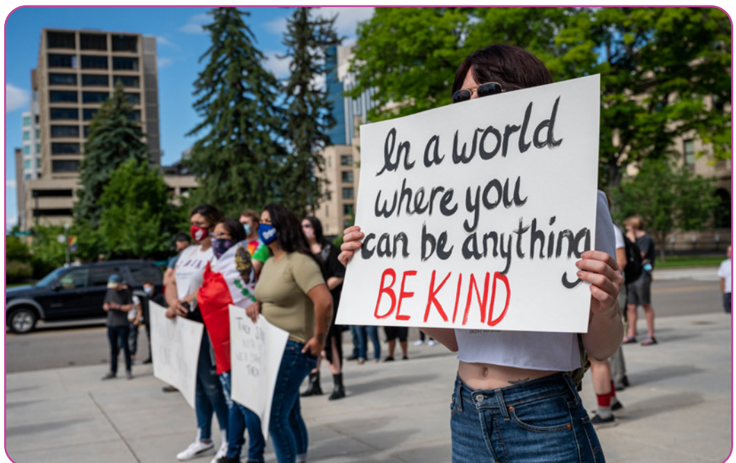
Figure 6.13 Manifestation

We will end our journey through the history of ethics in the 20th century with the philosopher and novelist Iris Murdoch . She emphasized that becoming a better person begins with seeing in light of the idea of good. This means seeing persons or situations justly, humbly, and lovingly, since perception governs actions. For example, if you see somebody that is different from you as dangerous or alien because of your own fear, this can lead you to treat this person in an unethical way.