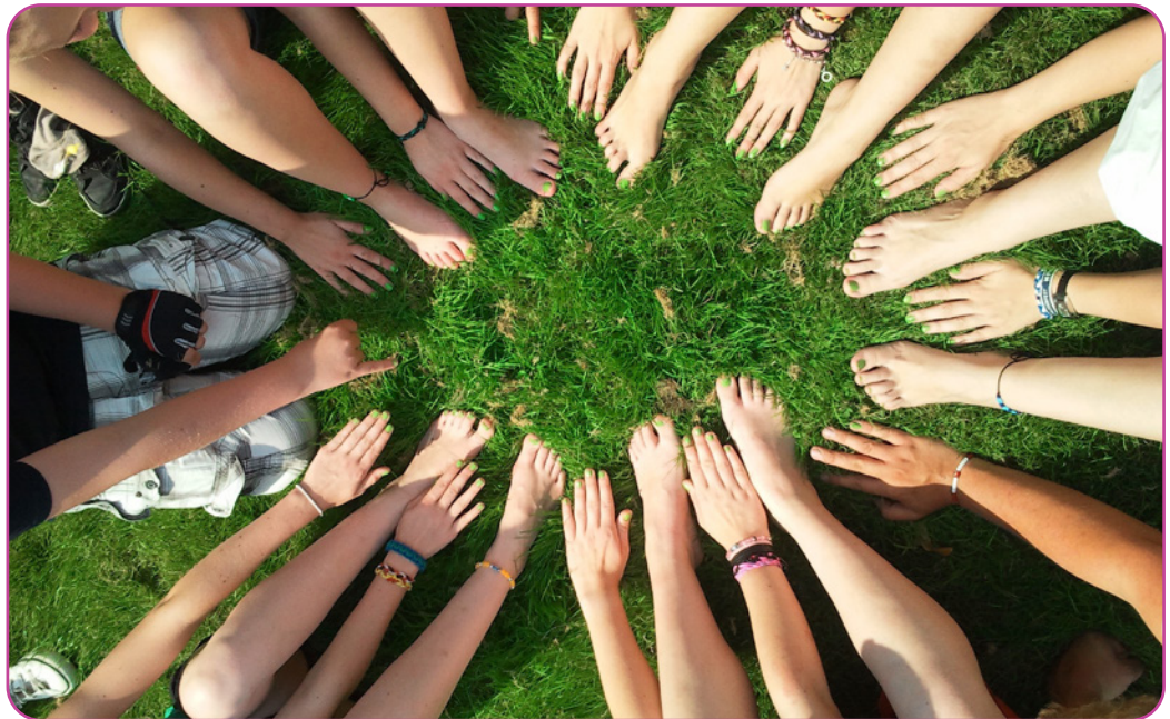
Figure 6.10

Socrates successors, Plato and Aristotle , understood ethics as related to virtues or our character, e.g., our being just, courageous, humble, and moderate. Plato rejected the claim that ethics is relative or dictated by the powerful. Ethics is objective, which means independent of particular interests or desires. He discussed a famous legend about the ring of Gyges. Gyges had the ring that rendered the one who wore it invisible. Others challenged Plato that if someone would be in possession of such a ring, one would not behave ethically, since one could get away with anything. Plato claimed that the person that is really ethical and truly knows what is good would not misuse the ring. Aristotle is famous for his doctrine of the Golden mean or middle. Virtue is the mean between two opposite extremes, e.g., courage is the mean between cowardice and foolhardiness, and generosity is the mean between stinginess and wastefulness. In order to live ethically, one must live virtuously, and the best way to becoming such a person is through education and the following of role models.