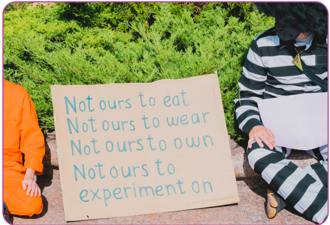
Figure 6.12 Animal Rights Protest

We will end our journey through the history of ethics in the 20th century with the philosopher and novelist Iris Murdoch . She emphasized that becoming a better person begins with seeing in light of the idea of good. This means seeing persons or situations justly, humbly, and lovingly, since perception governs actions. For example, if you see somebody that is different from you as dangerous or alien because of your own fear, this can lead you to treat this person in an unethical way.