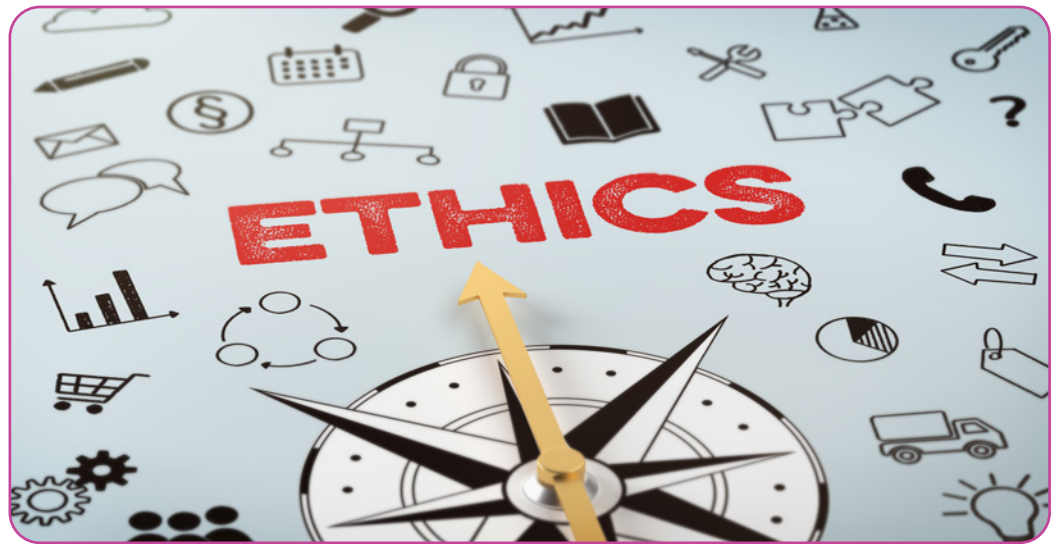
Figure 6.1 Ethics Compass

Please write down five things that come to mind when you think of “ethics”?