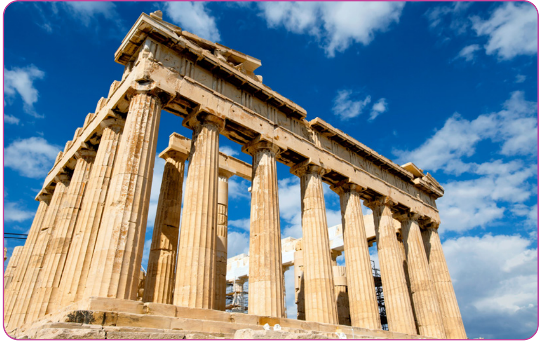
Figure 6.3 Parthenon

Ethics is thus a joint effort of all of us to preserve common humanity. Our common humanity and human dignity also provide a basis for human rights that each and every one of us possesses. But ethics extends beyond humanity and includes taking into consideration other fellow beings and the Earth as a whole, not merely because it sustains our life, but because it is valuable as such. Think about the following example that concerns animals. So-called animal ethics deals with questions about the moral status of animals and our treatment of them, for example, if it is morally permissible to raise animals in very contained spaces and use them for food as meat. Animal ethics looks for reasons for our practices involving animals and the need to change them. For example, one such reason would be that animals can feel pain just as we do.