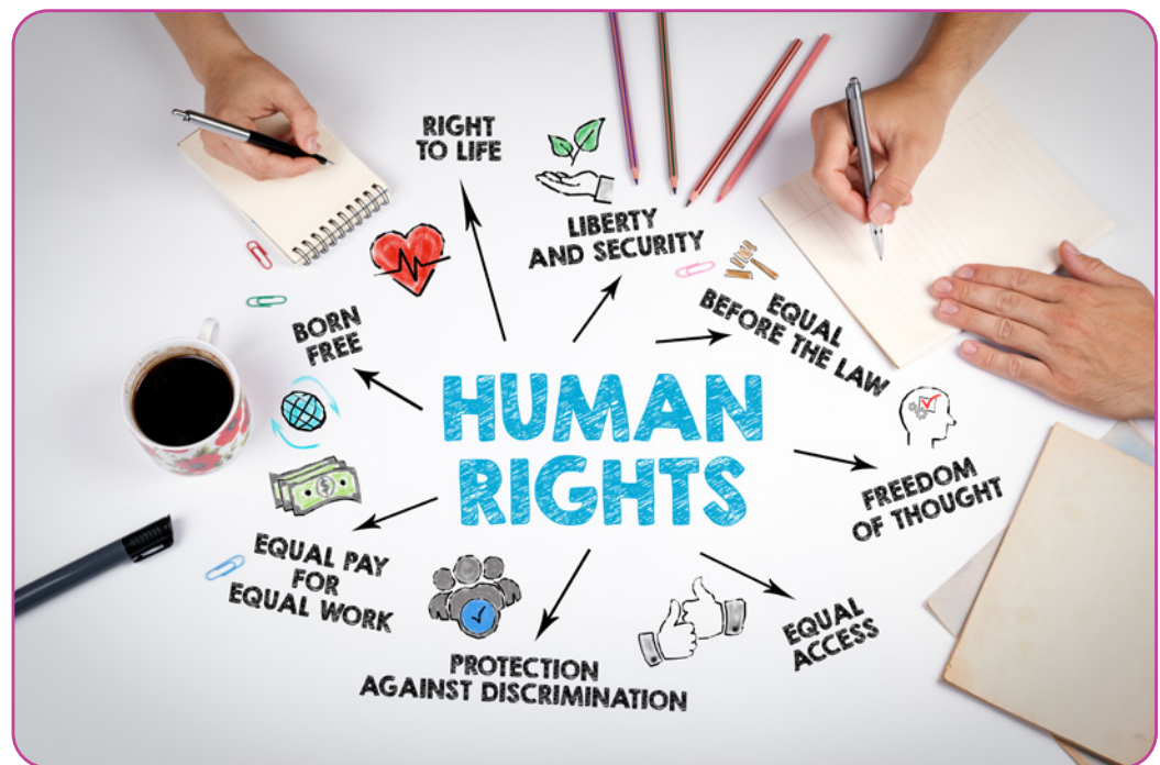
Figure 6.8 Human Rights