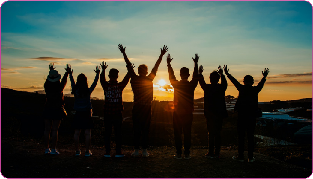
Figure 6.7

Virtues are morally valuable qualities of our characters, that is, of us as persons. For example, honesty, kindness, compassion, civility, fairness, generosity, and courage are usually regarded as virtues. The opposite of virtues are flaws or vices, for example, arrogance, cowardice, greed, laziness, narcissism, envy, and vanity. Virtues and vices are parts of our character, in particular, those parts that we have some control over. We can cultivate virtues and try to get rid of vices. Virtues are formed through moral upbringing. Since there is no specific list of rules or instructions on how to be virtuous and behave virtuously, it is often the case that we can begin by following an example of a role model. Role models (real persons or even fictional ones) help us, first, in seeing what kind of persons we want to be, and, second, as we work to become such persons. In this sense, role models represent ideals. An ideal is a certain perfection or model of excellence that helps us think and act ethically. An ideal can also be a broader model as when we think of what an ideal society would be, e.g., one fully governed by justice, respect, care, and sustainability.