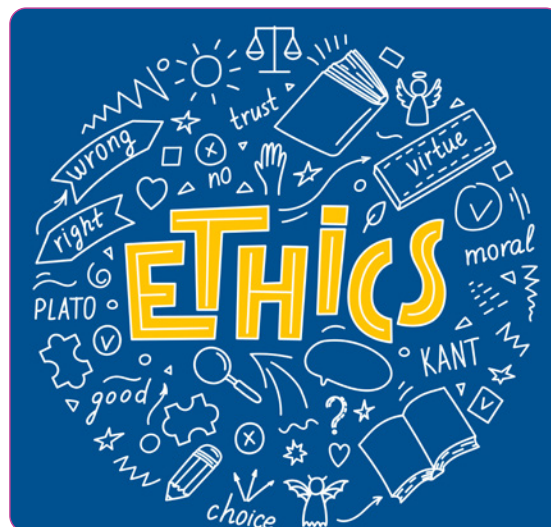
Figure 6.6 Dimensions of Ethics

When we think about the ethical status of actions, we use the terms right and wrong, as when we say that what someone did was right or that a certain act was wrong. We use these terms to evaluate actions. Actions that are right and that we have an obligation to implement are called duties. To have a certain duty means, in the most direct sense, to be bound by a binding ethical requirement. Sometimes it may happen that we have more than one duty and if we do not have a clear answer on what to do, that is which duty is more important, we face a moral dilemma. Being ethical is not always easy. What can help us are ethical principles and rules. Ethical principles are usually more general (e.g., “Respect the freedom, autonomy, and equality of people”), and moral rules are more specific (e.g., “Don’t lie”). Both help us, first, determine what is right and wrong, and, second, decide what we must do in a particular situation.