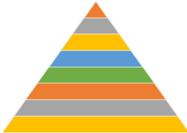
Figure 6.5 Value Pyramid

Part1: Think about what you really value in your life, that is, which are the values that matter to you. Write what you think of down and then rank these values by positioning them into the pyramid below, with the most important value being at the top. It might be hard to decide on some of them, but try to give it a go.