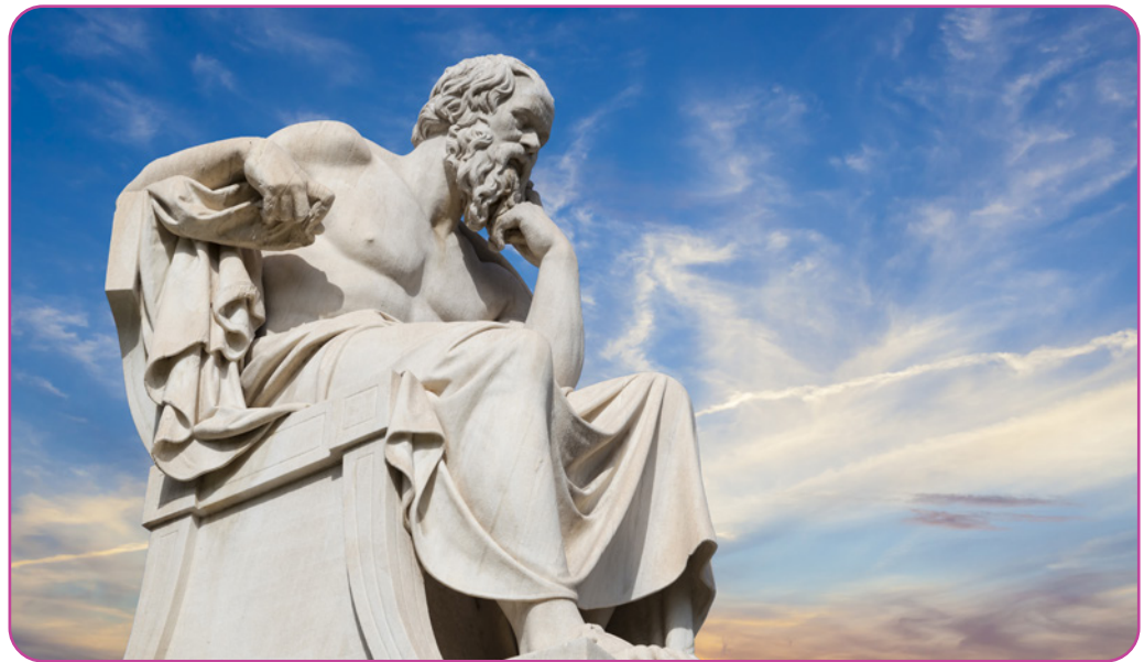
Figure 6.9 Statue of Socrates

Socrates , a Greek philosopher from ancient Athens, is famous for his words that “the unexamined life is not worth living.” Socrates emphasized that being ethical does not mean merely following the laws or customs, but that one must think and reflect on what is right. One must challenge conventions, and Socrates was known to stroll the streets of Athens, discussing various issues with others and challenging their views. It is important to listen to the voice of our moral conscience, to what we truly think is right. Doing this will also promote our own happiness.