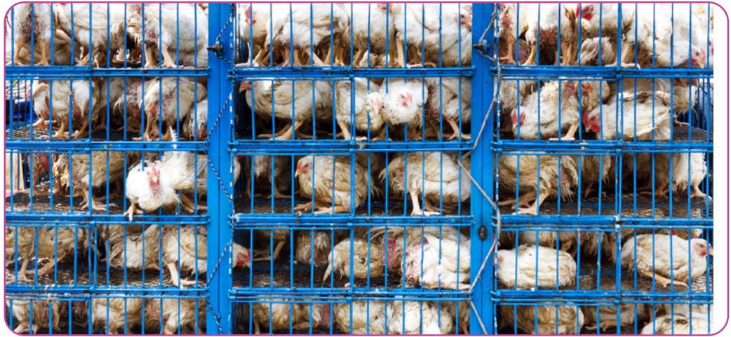
Figure 6.11 Chicken Transport