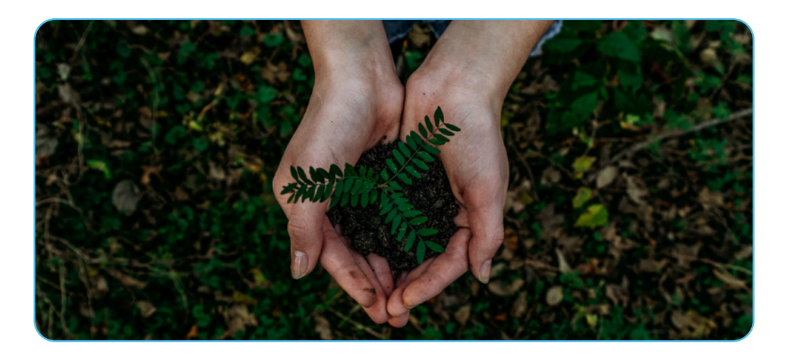
Figure 3.6

Genesis 1 teaches us that man was created in the image of God. This means that man must ...... for the creation of God, the earth, just as God would do. It means that man is ..... for nature, animals and other people. Creation is a precious gift from God with which man must deal in a caring manner.