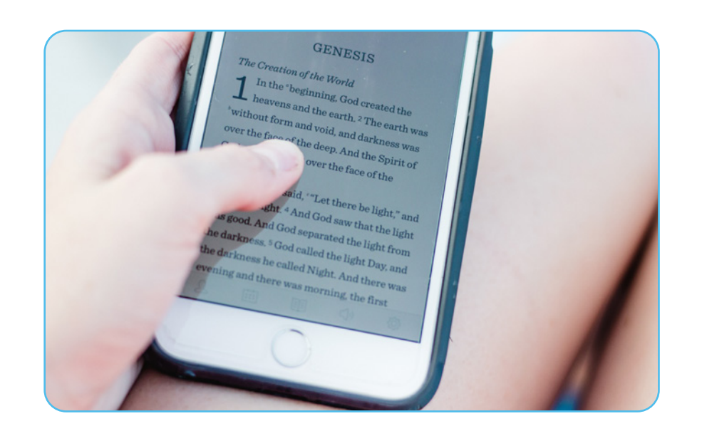
Figure 3.4

The story of creation is a very old text written a long time ago in a very different culture than ours. This story can be found in the book Genesis . This is the first book of the Old Testament . The Old Testament is more than 2000 years old. Although Bible stories were written a long time ago, they can still have an important meaning for us.