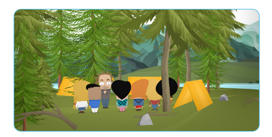
Figure 3.2 The Video Clip

Do you have any idea how the Catholic Church handles the care of our planet?