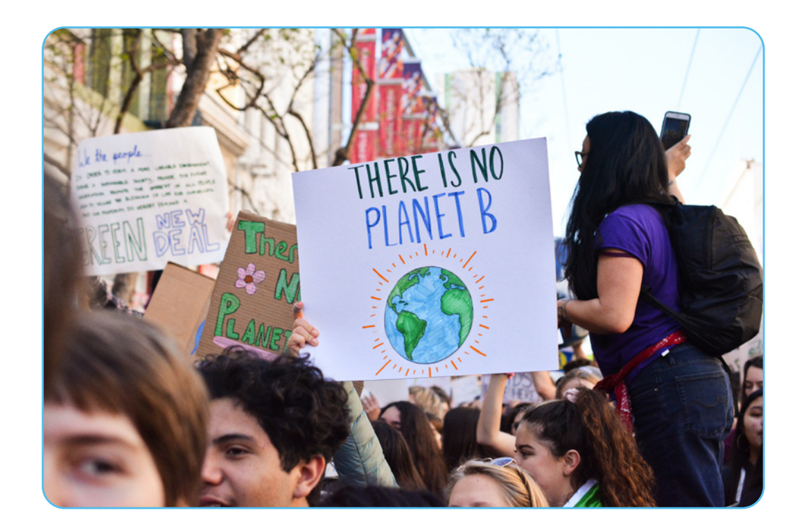
Figure 3.7

ASSIGNMENT. "God saw everything that he had made, and indeed, it was very good" (Genesis 1:31). Would he think so today? Why yes/no? What would you 'recreate' in the existing world?