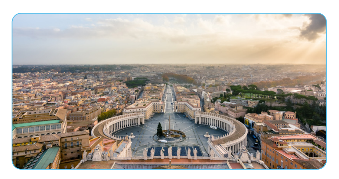
Figure 4.4 St. Peter's Square in Vatican City

What does 'righteous(ness)' mean? And what does 'unrighteous(ness)' mean? Righteous(ness) means 'the right, honest thing'. Being 'just' means being honest and trustworthy. Unrighteous(ness) is just the opposite: something that is unfair or incorrect. An example of this is poverty: it is an injustice that certain children in the world have to go hungry, while other children have enough, or even more than enough.