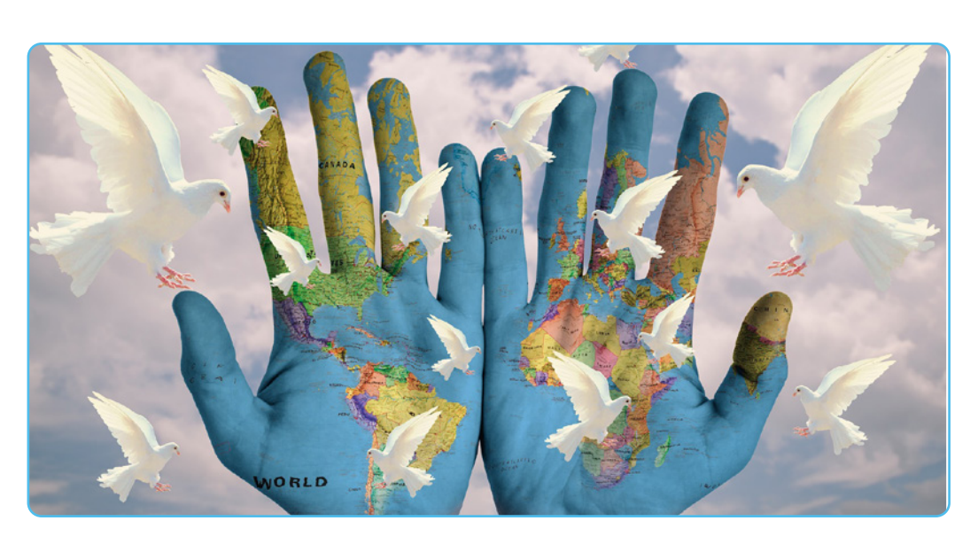
Figure 4.5

Do you think these conditions are enough to avoid war? Why do/do you not?