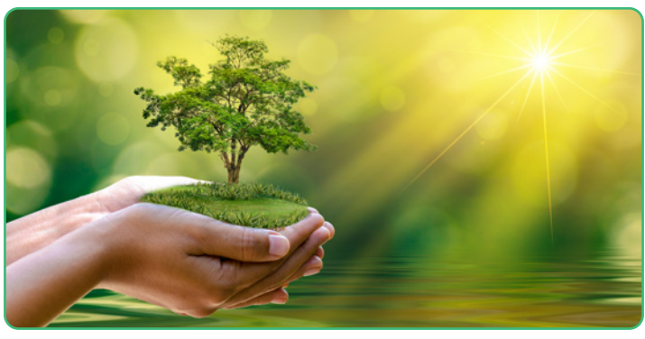
Figure 3.3

Besides ecology in general, the Quran also draws attention to the environment. Here too, the central message is that it is the task of man to maintain and respect the balance in nature. We speak