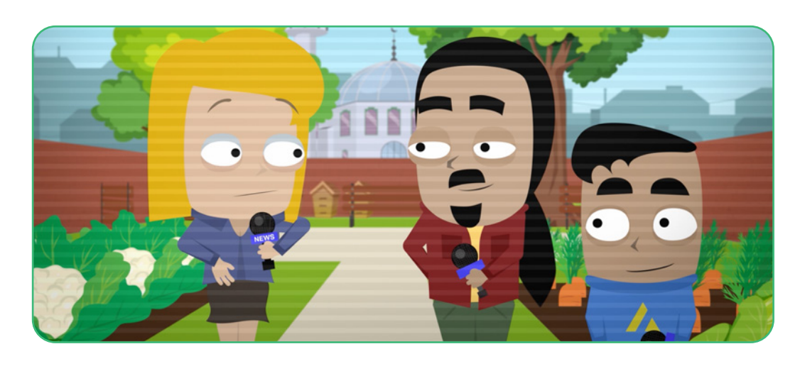
Figure 3.1 Video Clip

Young people across the country are encouraging each other on social media to periodically demonstrate for a new climate policy and social justice. The demonstrations take place every Monday from 10:00 am. While most of the protesters should actually be in school at that time, they argue that their actions serve a higher interest of society. While many schools implicitly agreed to the protesters' absence for the demonstrations, they do not agree with the way some protests occur.