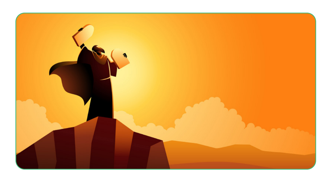
Figure 5.4

2. After all, every effort is made in order to create an opinion on the guidelines of Islam. It is important to emphasize that it's an opinion for no one can claim the absolute truth with all certainty. In other words, no one represents God on earth and only He knows the absolute truth. That is why all scholars always end their ijtihad with Allahu a'lam ( wich means "Allah knows better"). In short, the divine laws include the will or guidance of Allah and these are interpreted through ijtihad .