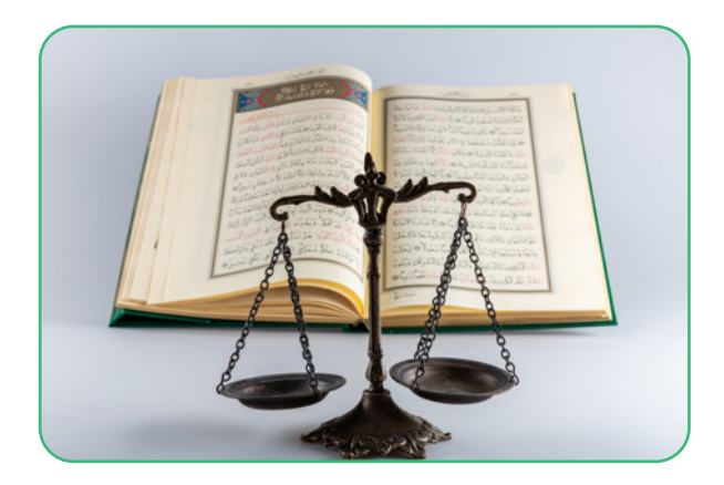
Figure 5.10

As mentioned before, justice is the highest priciple of sharia and it doesn't matter how this is realized or brought about as Ibn Alqayyim beautifully stated.