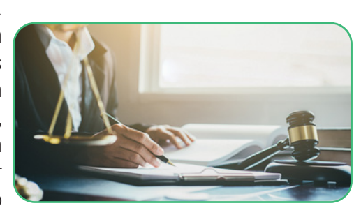
Figure 5.7

to draw inspiration from their faith. Freedom of religion is thus an important good in Europe. As long as that inspiration is in accordance with the constitution, science and reason, it can fit within the story of European values. But this requires a reflection for muslims by reading their faith more to the spirit and less to the letter.