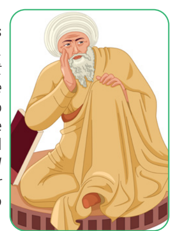
Figure 5.2

Ibn Rushd was strongly convinced that it is impossible for reason to be in contrast with Islam. That is why he says: "After all, the truth is not contrary to truth, but rather must agree with it and be a confirmation of it." With the first truth he refers to the truth that one obtains through the mind and the second truth refers to Islam. Finally, he concluded his book with the following statement: "... by this I mean that the mind is the friend and foster sister of religion." In other words, reason and faith are two methods of finding out the truth.