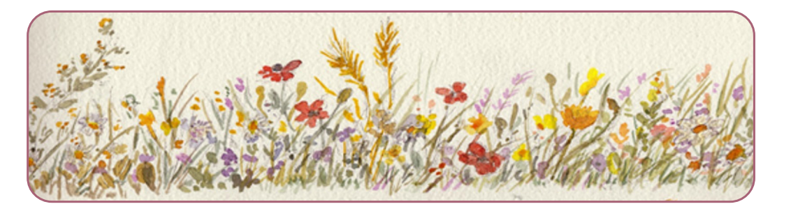
Figure 3.2 Aquarelle by Vaso Gogou

<sup>8</sup>And the Lord God planted a garden in Eden, in the east; and there he put the man whom he had formed. [...] <sup>15</sup> The Lord God took the man and put him in the garden of Eden to till it and keep it.