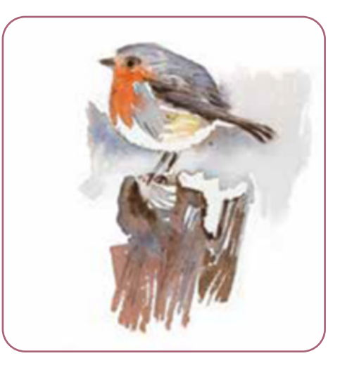
Figure 3.3 Aquarelle by Vaso Gogou