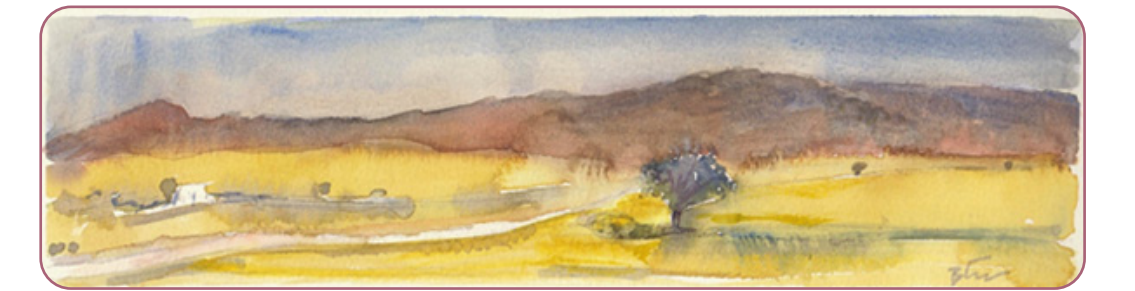
Figure 3.5 Aquarelle by Vaso Gogou

The way out of the ecological crisis according to the Orthodox Christian point of view is: